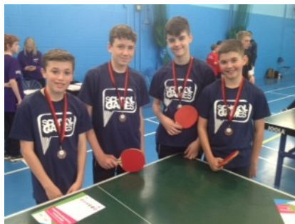
The teams with their medals