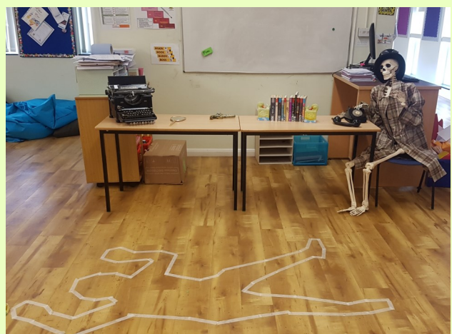
The Escape Room setting