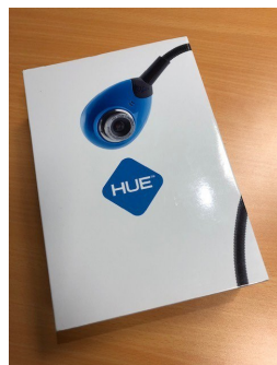
One of the new Visualisers

Or, you can support the PTFA by joining the Big Cash Draw. It's only £12 for the year - check it out on Parentpay!